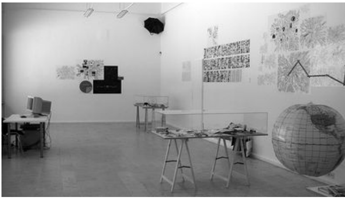
Lia Perjovschi, Plans for a Knowledge Museum , exhibition view.

Lia emphasizes the most important activity an archive can foster: sharing and teaching. While it was practically forbidden to share books, ideas, and information during the communist regime, she understood that a shared idea brings about another idea and that sharing is an essential survival strategy. This was certainly the case when Communism developed formal institutions that were so absurd that people avoided them altogether, replacing them with informal institutions (alternative economies and structures, the black market), strategies that continue to thrive as Post-Communist attempts at building faith through the mimicry of neoliberal models has proven neither promising