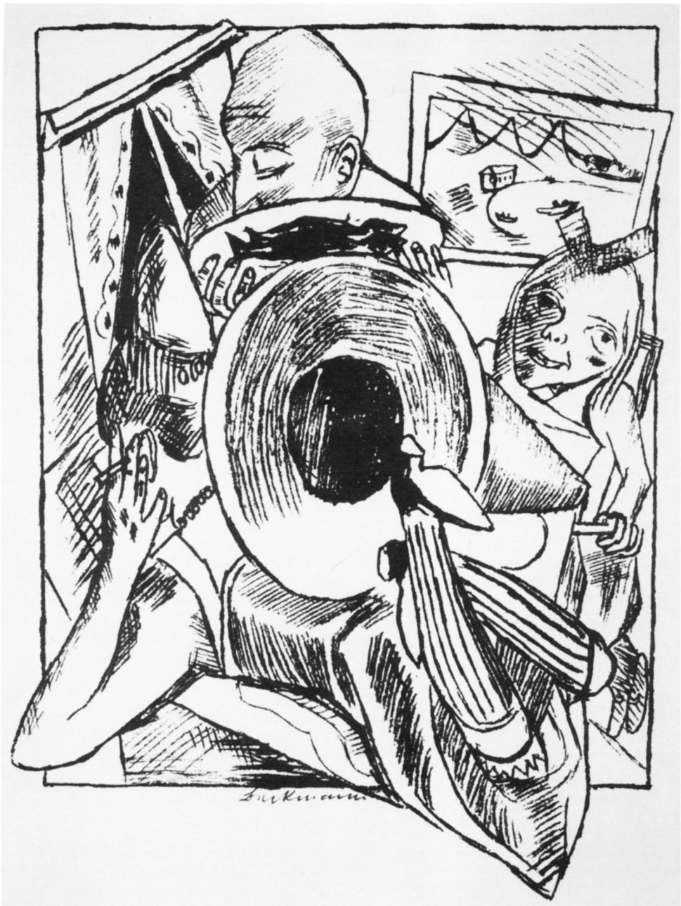
Max Beckmann. Möbliert. 1920.